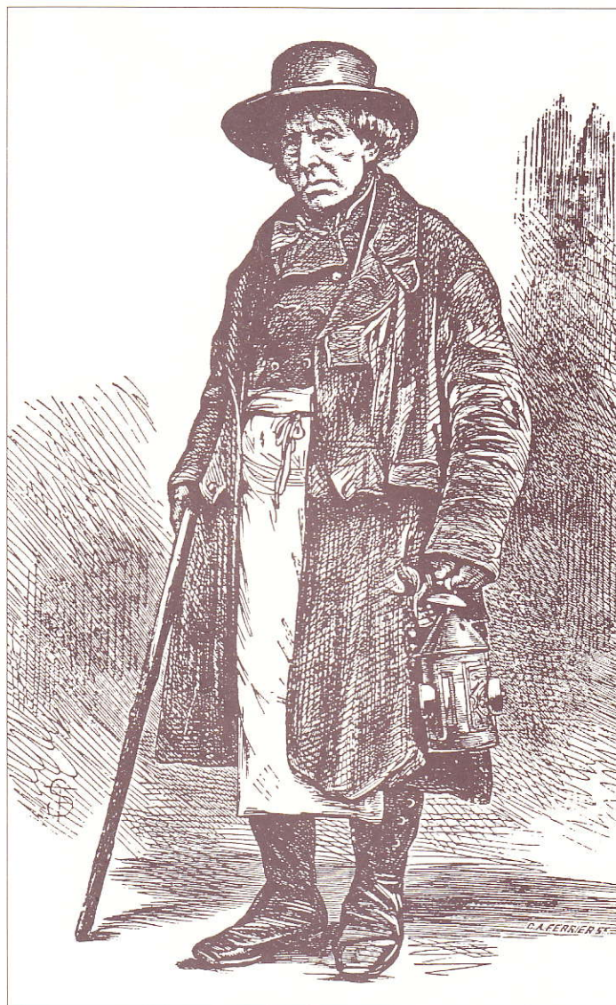
THE LAST OF THE "CHARLEYS"